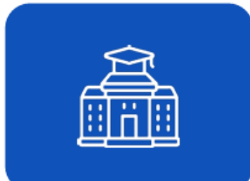
Institute / Universities