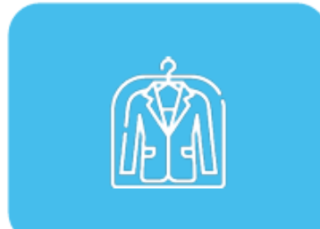
Launderers & Dry Cleaners